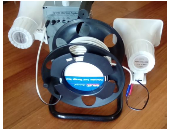
Extension Speaker Connection.

The purchase and use of a cable reel greatly aids the management of the extension cable.