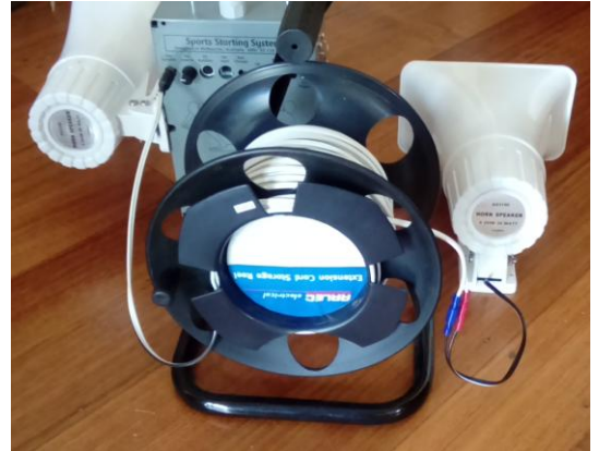
Extension Speaker Connection.

The employment of a cable reel greatly aids the management of the extension cable.